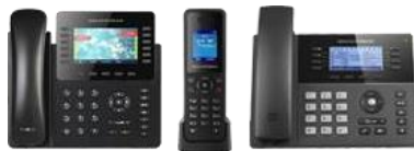
IP Voice Telephony