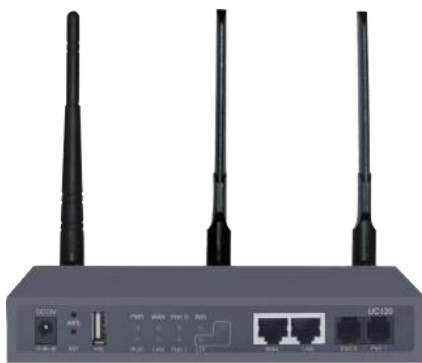
SME IP PBX

Dinstar is an industry-leading manufacturer which is having its specialization in VoIP solutions and IP voice value-added services.