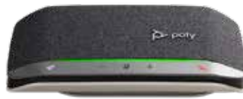
POLY SYNC 20