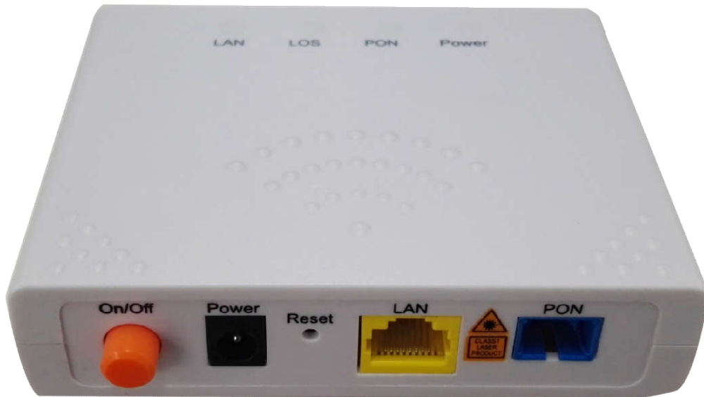
Picture 2-1 RL801G product figure