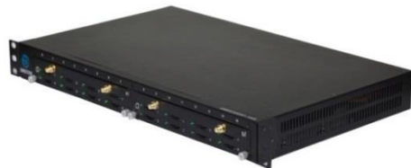
DWG2000F-16G/C-M (Built in 4-1 Antenna Power Divider )