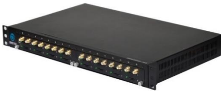
DWG2000F-16G/C (Standalone Antennas )