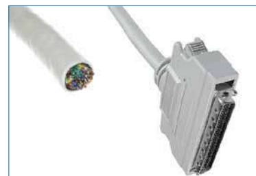
Punch Down Cable

IP/IPX over Frame Relay/ PPP/HDLC/X.25, X.25 over Frame Relay (Annex G), BSC over X.25, SNA over X.25, PPPoE, PPPoA, IP over ATM