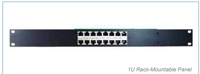
1U Rack-Mountable Panel